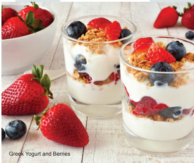
Greek Yogurt and Berries

Tortilla chips and salsa | $3.50 per person