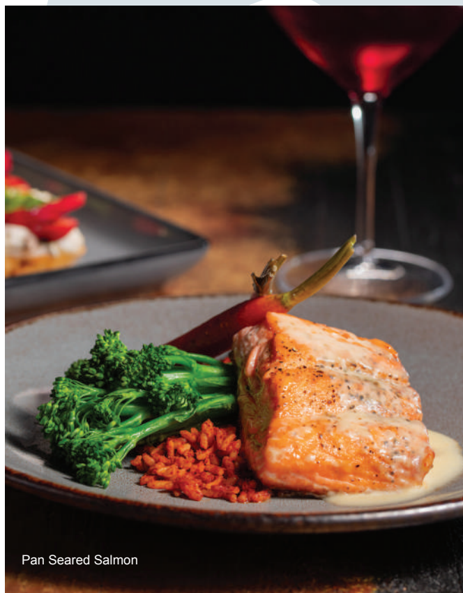
Pan Seared Salmon

Assorted Cheesecakes Chocolate Fudge Cake Mixed Berry Crème Brûlée (Available option for Buffets under 60 people) Lemon Tres Leches Cake Citrus Olive Oil Cake