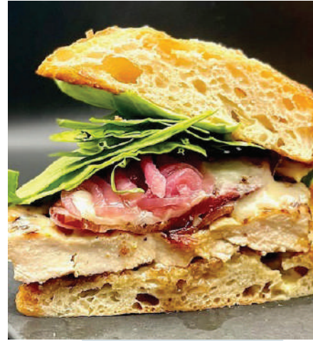
Grilled Rosemary Chicken Sandwich

Served on ciabatta bread, with Italian cured meats, provolone cheese, tomatoes, onion, shredded lettuce, peppers